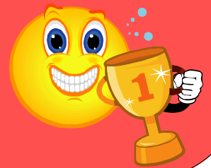
Table Topics Contest