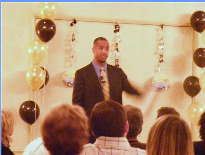
1999 World Champion Craig Valentine